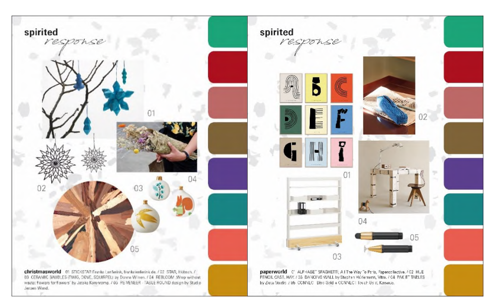
"spirited response" inspires with sustainable solutions: original, creative and unconventional.

Not a trend, but a necessity. This style world presents attractive alternatives and unconventional solutions that focus on zero waste, a circular economy and up & recycling. Here the emphasis shifts to the arrangement of the home office for job and school. The design is handcrafted, creative, cheerful, colourful and uncomplicated. Organic forms and eye-catching, illustrative designs reminiscent of the 1960s have a strong impact. Hand written or drawn print motifs, childlike sketches and ideas with an improvisational character round off the original style.