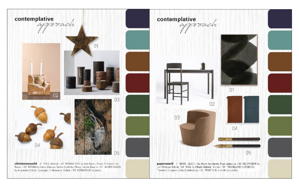
"contemplative approach" focuses on nature: original, tactile and unpretentious.